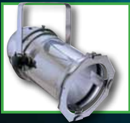
Traditional Par Lights