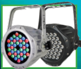
LED Par & Wash Lights